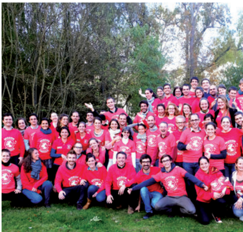
Photo : Returning Fidesco volunteers in Novembre 2016

Let us not forget that the former volunteers participate regularly in the formation of the next volunteers transmitting the missionary fire to them!