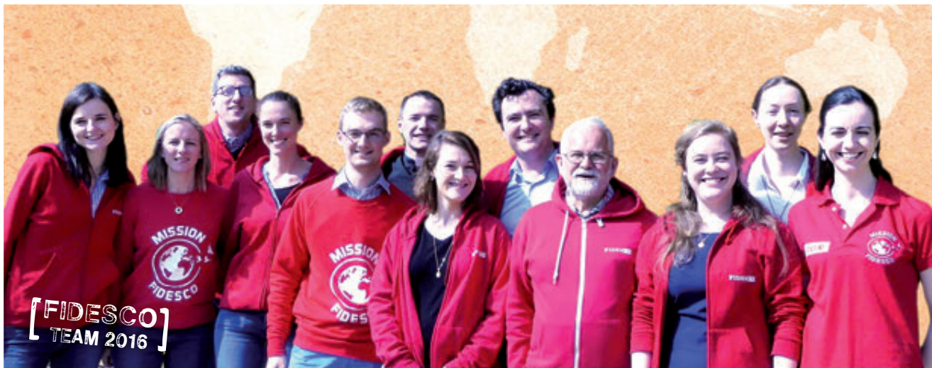
A team of 10 employees at Fidesco headquarters in Paris coordinates all international activities related to volunteer recruitment, training, monitoring, communication, mission funding, fundraising and project management.

What will we remember from 2016? Was it a year marked by terrible events and painful situations, in France and all over the world? A year that has seen foreign situations internationalized to the point of having consequences, more than ever, close to home? Perhaps it was a year that taught us that the problems of underdeveloped countries were deeply intertwined and interdependent with our own lives in Europe? Or was it a year that gave us a chance to reach out, to get to know each other, to follow Christ, to smile, to hope?